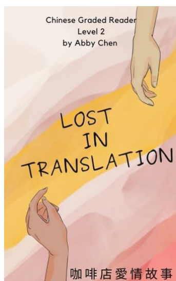
Lost in Translation 《咖啡店愛情故事》

For more information, please visit www.TalkTaiwaneseMandarin.com