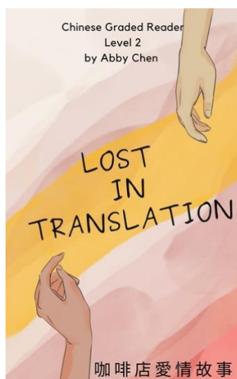
Lost in Translation 《咖啡店爱情故事》

For more information, please visit www.TalkTaiwaneseMandarin.com